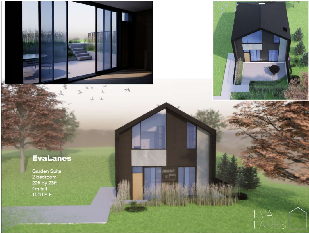
Recessed garden suite from Eva Lanes - www.evalanes.com

The new garden suites program from the City of Toronto allows qualifying property owners to construct a garden suite “as of right” on their property, with simple building permit application and no political approval or committee of adjustment approval required. In most cases, no variances are required and no appeals or “neighbour vetoes” are permitted. The city also waives development cost charges.